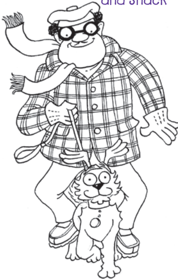
Professor Foodsmart and Snack

Colour the pictures then fill in the missing letters to say what everyone's sport is.