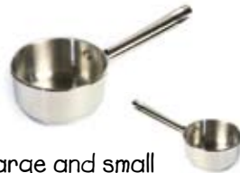
large and small saucepan

glasses, plates, bowls and cutlery to serve your food