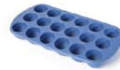
ice cube tray

Here is some equipment you may use when you cook my recipes.